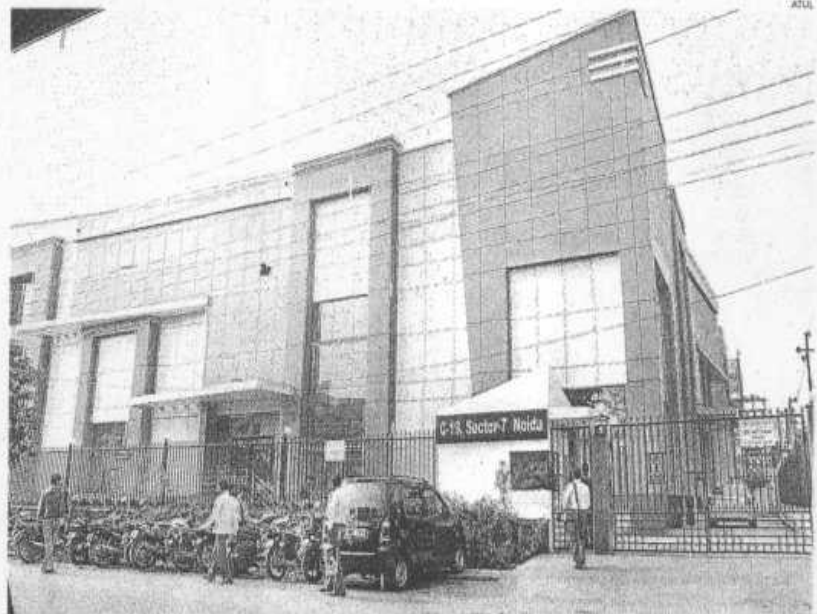
The office of recruitment agency Connect Global (above). The Netambit office is on the right. Inset: The controversial email advertisement.